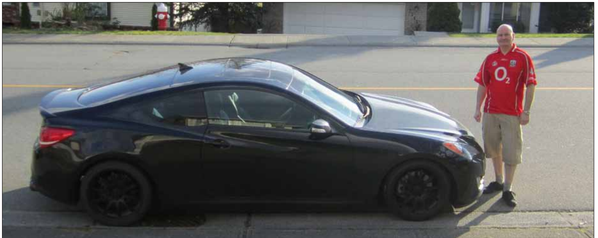
Me and BB on a sunny day

More info: www.cruiseforyourcause.org/event