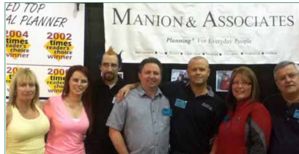
Hair stylists and Manion staff who donated their time.

This year's event took place April 29-May 1 at Planet Ice Maple Ridge in partnership with Manion & Associates and Ridge Meadows Hospital Foundation. All proceeds were raised in support of cancer patient services. Participants collected pledges and had their hair shaved or cut by our volunteer stylists who gave of their time. Thank you. Watch for us at the 2012 Home Show!